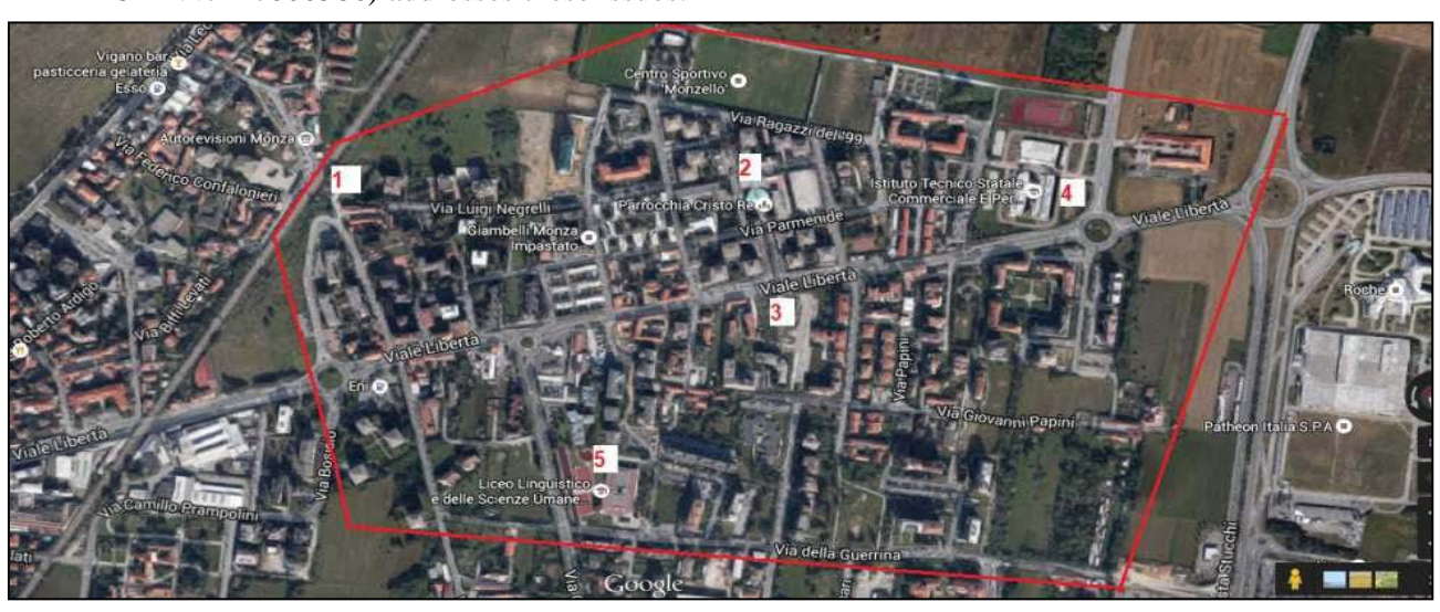
Figure 1. Noise LEZ pilot area (Libertà district).

The method proposed consists in the evaluation of