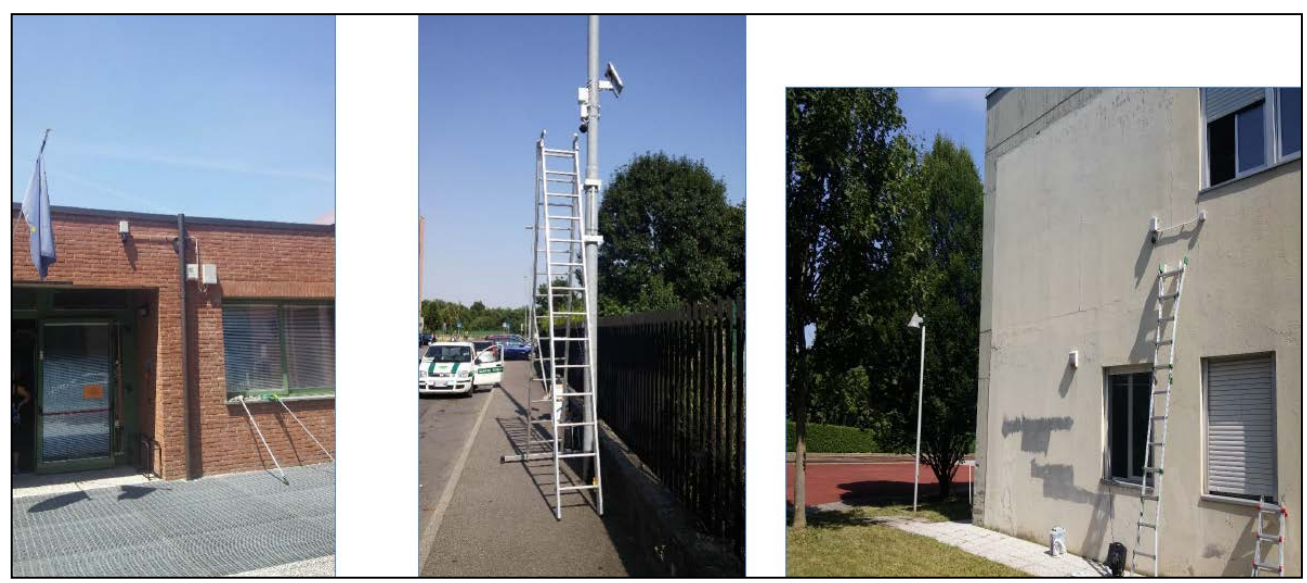
Figure 4: Smart-noise monitoring stations

An automatic road traffic monitoring system will also be used, in order to support long and short term noise monitoring activities and also air quality analysis.