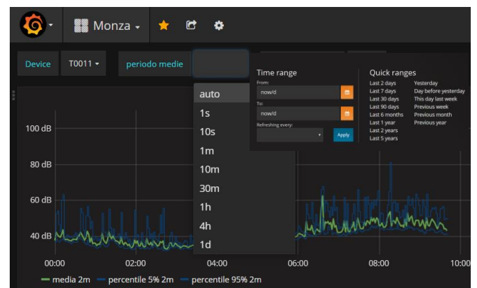
Figure 3. Web interface with possibility of selecting the time period to view and/or download.

A web interface (Figure 3) has been developed aiming to make possible to view and download data referred to a user-defined time period.