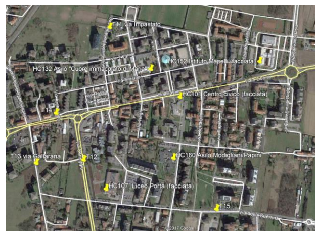
Figure 2. Site plan with the identification of noise monitoring stations.

From a practical point of view, 10 monitoring stations are expected to be installed in the pilot area of Libertà district, as illustrated in Figure 2. In particular, 2-3 microphones will be placed along the Viale Libertà, the main street where the traffic flow mix is expected to mainly change from ante to post operam scenario. The other microphones will be uniformly distributed along other streets belonging to the pilot area.